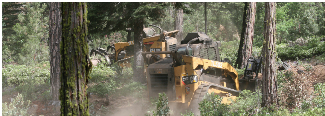
CAL FIRE Tree Mortality Task Force equipment helps with a thinning and brush clearing project.