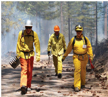
Members of the holding crew coming off the prescribed fire's perimeter line.