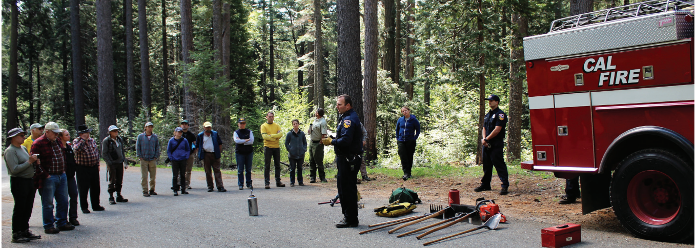
Forestland owners attending the Prescribed Fire Workshop at Blodgett Forest Research Station near Georgetown get a run down on equipment used to manage prescribed fire from CAL FIRE equipment experts with the Amador El Dorado Unit Training Bureau.