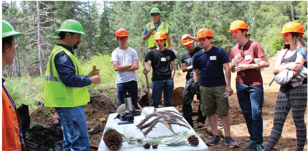
Students talk with plant and wildlife biologists about the role these professions play in logging operations.

The outlook for good paying forestry-related jobs in California has greatly improved compared to opportunities in past decades. That's the message Ponderosa High School students got while participating in a career-day event sponsored by the Sierra-Cascade Logging Conference.