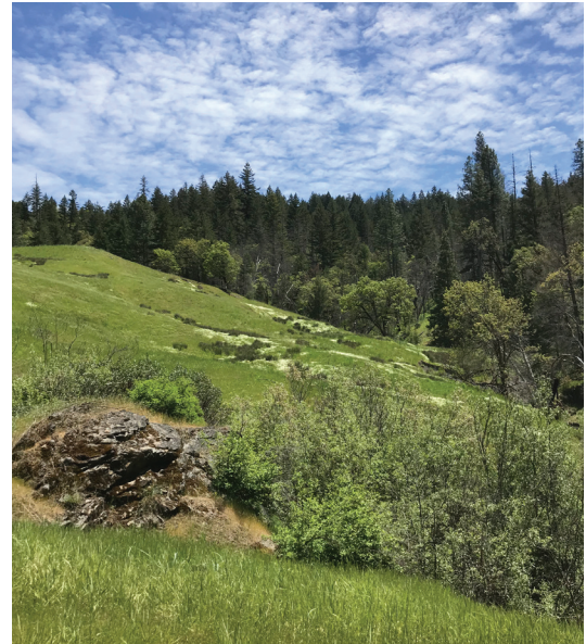
Improving the vitality and function of California forestland is a top priority for landowners and the public. This healthy meadow and forest scene is near Ruth Lake in Trinity County.

Yosemite Stanislaus Solutions (YSS) is a col-