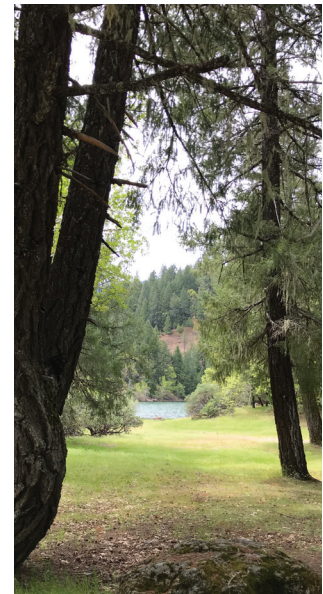
Good funding strategies can help open forests for better health.

The University of California Cooperative Extension also offers a free guide to "Taxation and Estate Planning," online at: https://bit.ly/2x2vAXJ