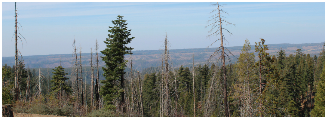
North-facing view from the 2013 American Fire burn scar in Tahoe National Forest. The site of the nearly 30,000-acre wildfire remains an active forest fire research location and living laboratory for reforestation.

An Executive Order to improve the health of the state's forests and help reduce the threat of wildfires was issued on May 10 by California Governor Jerry Brown.