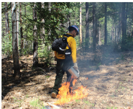
Prescribed Fire Workshop participant uses a drip torch to start a slow moving burn.