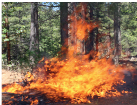
Flames quickly died down during the carefully planned prescribed fire treatment.