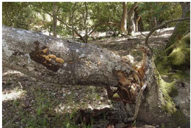
Coast live oak killed by sudden oak death.