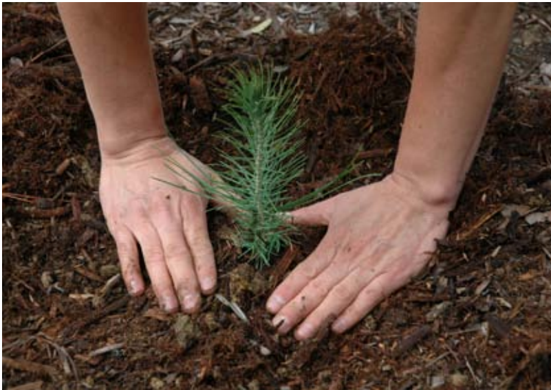
Reforestation helps sequester carbon.