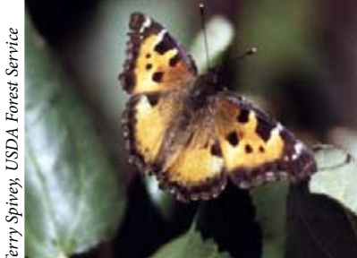
California tortoiseshell butterflies lay eggs on Ceanothus plants.

should be focused on species that have much higher densities than they would under natural fire regimes, for example, firs and incense cedar. Address