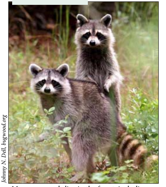
Many mammals live in the forest, including these intelligent opportunists.