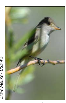
A vigorous understory is important for concealing nests and supporting invertebrates that birds, including the willow flycatcher, prey upon.