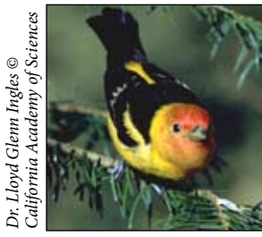
Western tanagers prefer open coniferous forest habitat.