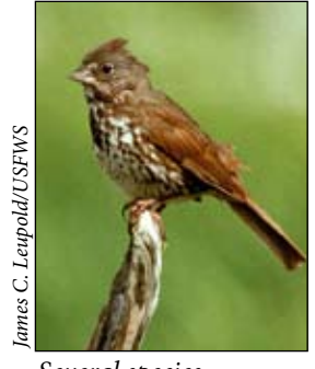
Several species, including the Sierra Nevada subspecies of fox sparrow, are dependent on shrub habitat. Shrub fields are a source of fruit, nectar, and seeds used by shrub nesting birds, as well as adjacent forest nesting species.