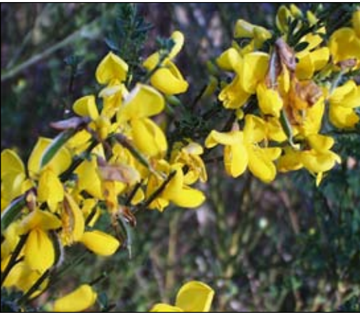
Scotch broom is very pretty but invades natural areas and spreads fire. Avoid the temptation to plant these and other invasive plants.

Learn your rare plants and protect them. There are a number of plants in decline in California due primarily to habitat destruction. The Redbud Chapter of the California Native Plant Society would be happy to help you learn how to help native plants thrive. Their website is at http://www.redbud-cnps.org/.