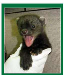
Little Orphan Annie

Learn about current fisher studies and issues from California Department of Fish & Game http:// www.dfg.ca.gov/news/issues/fisher/ and Sierra Nevada Adaptive Management Project (SNAMP) http://snamp.cnr.berkeley.edu/teams/fisher.