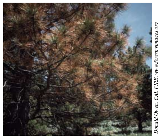
Redbelt on ponderosa pine. These needles are the victim of winter damage. Although the crown of the tree has an overall brown cast, closer inspection reveals that needle bases are green. The damage is minor and the tree is neither dead nor dying.

distributed around the circumference of the bole (trunk).