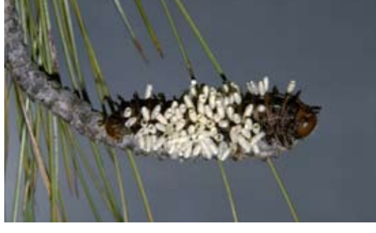
In natural systems there are checks and balances that keep pest species under control. Here a pandora moth has been parasitized by another insect.

Bark beetles and engravers are the most serious insect pests in California. They bore through the bark of most pine and fir species. These insects generally attack stressed or weakened trees. They often work together: