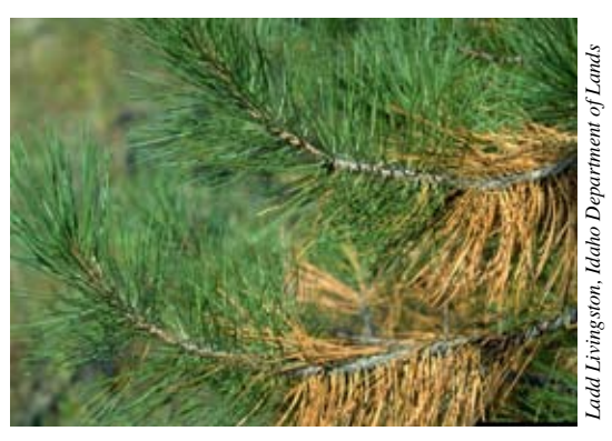
Normal needle cast on a ponderosa pine in fall. The appearance of dead needles can be alarming but look for new needles in the spring.