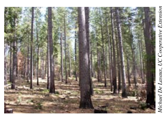
In shaded fuelbreaks trees are spaced to slow a wildfire so that firefighters can gain control.

Thinning is conducted in young stands with small-diameter trees (pre-commercial thinning),