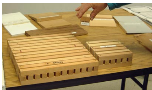
Studies are performed on various materials to determine performance. The brands (above) help to standardize the experiments.

There are trade-offs in making a home fire resistant. A wide overhang on a roof increases