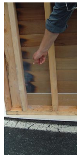
Each structure was ignited with a B brand. In this test structure, fire burned through the material.

For more information, or to find out about future workshops, contact Steve Quarles, (510) 665-3580; steve.quarles@nature.berkeley.edu .