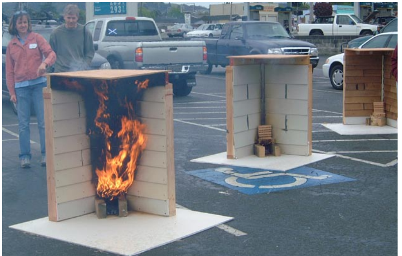
Extension Advisor Yana Valachovic observes the fire-resistant properties of various building materials during a workshop (see article p. 1).