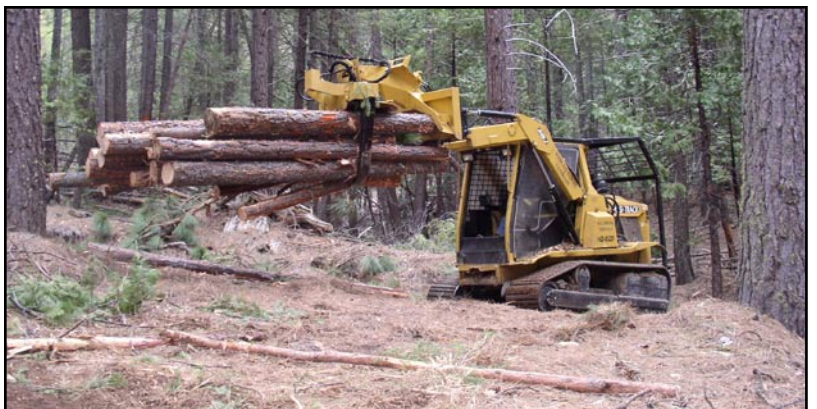
Research focuses on finding fuels treatment that are economically feasible for small landowners (go to http://ucce.ucdavis.edu/fuelreduction/ ).