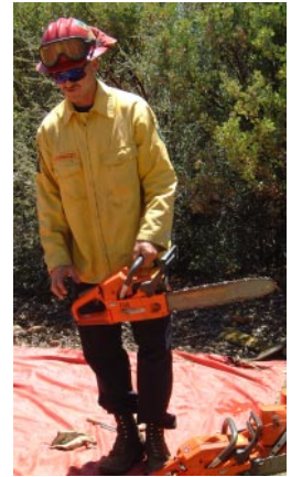
Firefighters at the CDF Fire Academy get a demonstration on chainsaw safety, then practice by clearing brush.