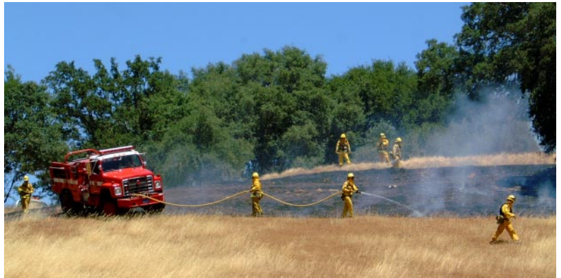
Wildland fires are only one aspect of CDF's mission.

CDF used to be primarily in the wildland fire business, but about 20 years ago the agency began to expand and is now the largest multi-task fire department in the world. In some counties, CDF contracts out to provide city and