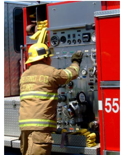
Setting the water pressure.