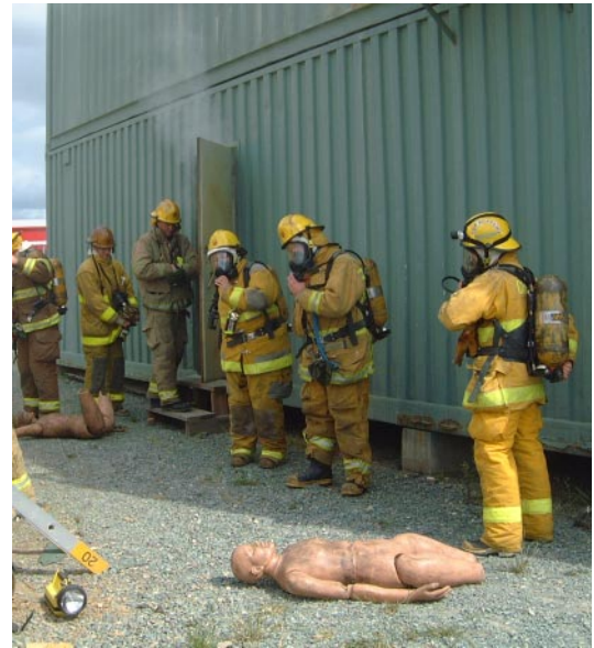
Firefighters accomplish the successful rescue of a mannequin from a burning building.

more. Setting up hydrants, when available, or getting water from other sources requires training and skill. Students spend time in the classroom, then go out to the field to put the book learning into practice.