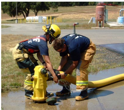
A timed hydrant exercise requires skill and teamwork.