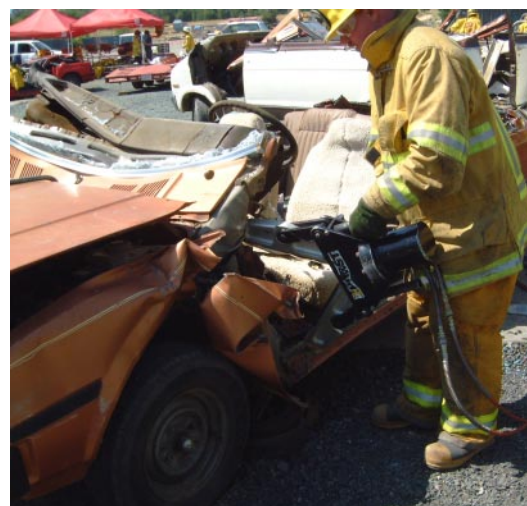
Learning how to take vehicles apart around the victim.

contours of the land to decide how a fire would move through the area, see what fuels are there to ignite, and look at other factors at the property—occupancy, water sources, hazardous situations, and other considerations. Within five minutes they must decide whether there is a reasonable chance of saving the structure.