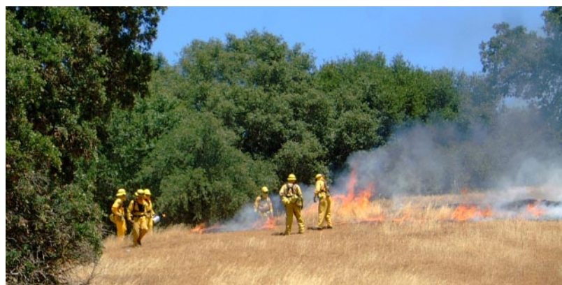
Fighting fire with fire.

Students at the Academy are motivated, their friendships bonded forever. Despite the hardships, the stress, and the demands of the Academy, one hears from the students again and again, "I love it. There's nothing I'd rather be doing."