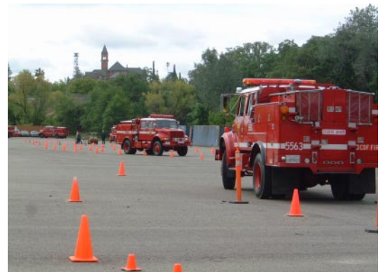
Practicing for the tests.