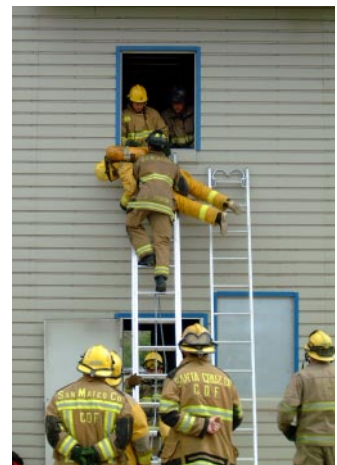
Firefighter down. Here, a victim is carried safely from a two-story building.