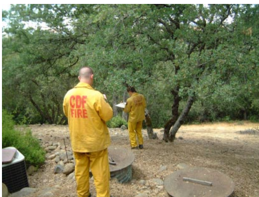
Triage—firefighters must quickly assess a property to decide if it can be saved.

engine is backed down the drive so it can leave quickly if necessary. The crew get a quick safety briefing from the engineer and agree on a retreat signal, then hoses are deployed. A garden hose is placed in the tank to help refill it while the house ladder is put up to allow quick access to the roof. At the same time, other members of the crew go around the property, with the owner if present, to assess the situation. Where is the propane tank, water, powerlines, woodpile, any hazardous material, and other concerns? The goal is to identify any hazards and mitigate them.