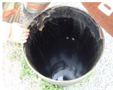
The Baby Jessica well is 19" deep and filled with 8" of water. This prop gives students practice in various emergencies.

technical subject—hydraulics—involving pump theory, water properties, pressure calculations, and much