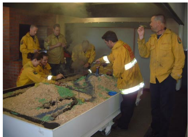
The sand table requires teamwork, imagination, and a sense of humor.

The basic drill is set but quick thinking and creativity are required in every aspect of the exercise, just as when a real fire threatens. The