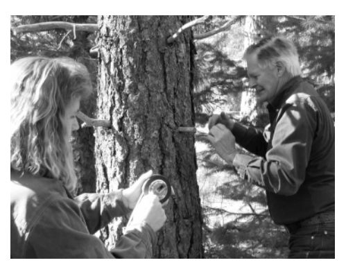
Boring a tree for age and measuring diameter with a D-tape. Forest Stewardship course field trip, Shingletown, Shasta County. September 2002.

Place and dates for the fall course will be determined in part by response to this article. We will go where the interest is.