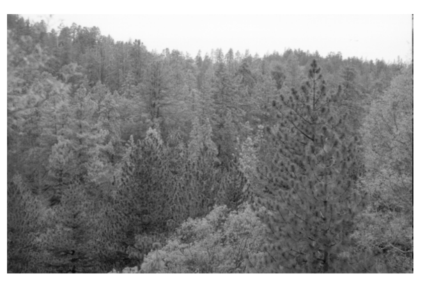
Most of the trees in this area of Lake Arrowhead are dead from bark beetle attack.

Unfortunately, once a tree is infested, there is usually little that can