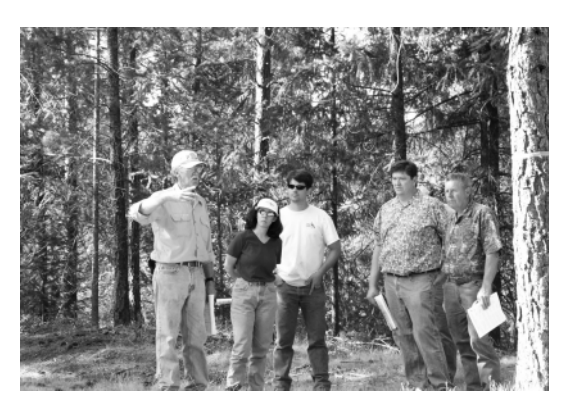
A visit to the Edwards Family Tree Farm. Forest Stewardship course field trip, Colfax, Placer County. October 2003. Watch this calendar for future courses. See article page 10.