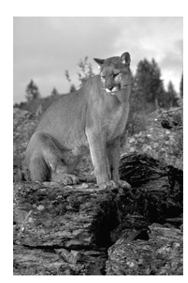
Mountain lions require large expanses of wildland to survive.

Volcan Mountain will remain an intact forest, thanks to an acquisition by the Forest Legacy Program (FLP). Now owned by the State, the property will be cooperatively managed by the California Department of Forestry & Fire Protection and Department of Fish & Game for forest management, wildlife, and education with an emphasis on fire ecology.