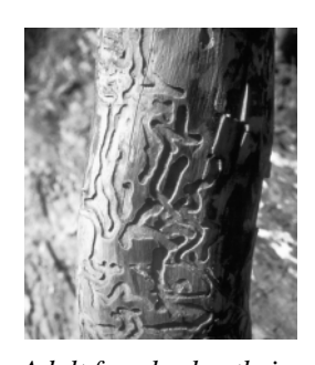
Adult females lay their eggs in tunnels under the bark. The larvae burrow away from the tunnel. Eventually, the tunnels girdle the tree. Each species has a characteristic tunneling pattern.

For more on the southern California beetle infestation go to <a href="http://www.fire.ca.gov/">http://www.fire.ca.gov/</a> ResourceManagement/so_cal_beetle_infest.asp. See also CDF Tree Notes #3, 9, 13, 19, and 28, available at <a href="http://ceres.ca.gov/foreststeward">http://ceres.ca.gov/foreststeward</a>.