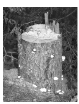
Fungi are carried on the bodies of bark beetles where they gain entry to the tree and further weaken its defenses.

Bark beetles are small, about the size of a grain of rice. There are hundreds of species; many attack a preferred host tree and/or part of the tree. Common species in California include