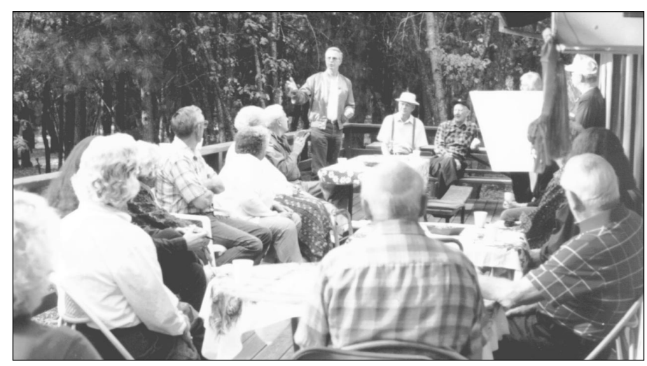
Neighbors meet over coffee to learn about fire prevention and forest health.

others are willing to speak to organized groups, go to schools, even come to coffee klatches organized by neighbors who have benefited from the fire prevention program.