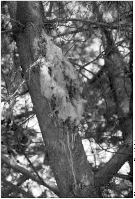
Pitch canker is an example of an exotic pest.