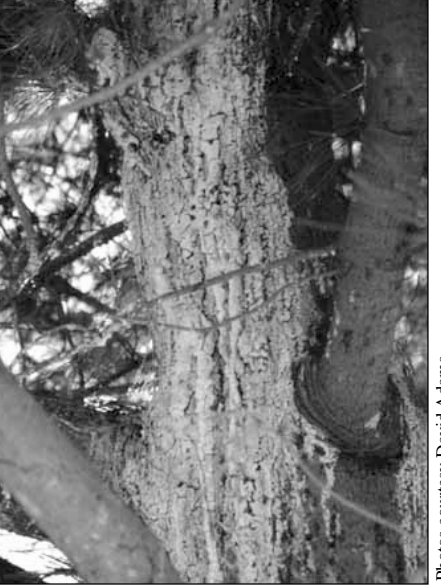
Large main stem canker. Note copious resin flow associated with canker.

transit and taken to the nearest landfill or designated disposal facility. Do not transport diseased wood out of infested counties.