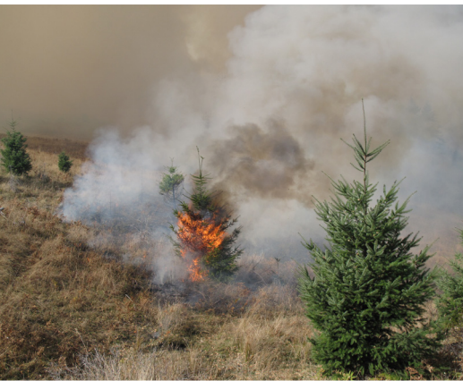
Redwood National Park during the Fall 2013 TREX. Prescribed fire is used to limit conifer encroachment into oak woodlands, conserve biodiversity, and maintain natural processes.

Fuels ignite in two ways: by lightning and by human activity. We have no control over lightning, but we can reduce human-caused ignitions, including equipment use, vehicles, smoking, campfires, power lines, and arson.