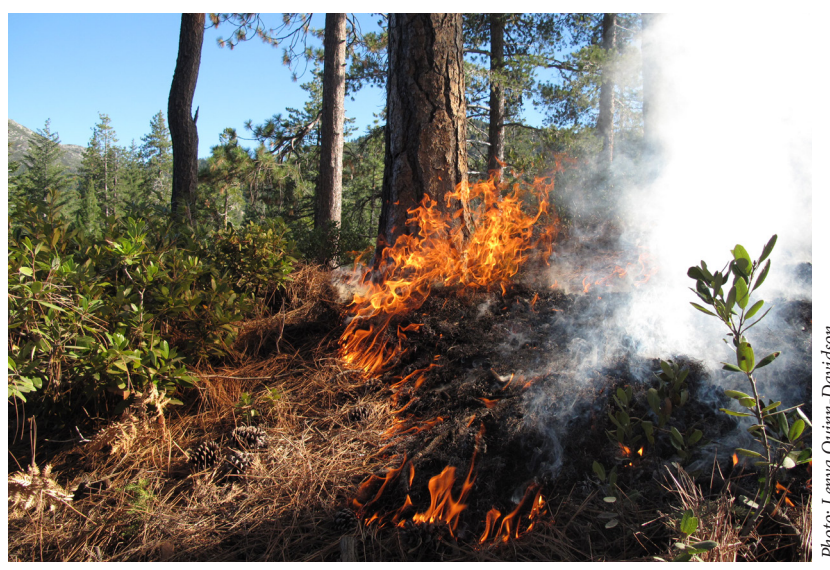
Prescribed fire in Whiskeytown National Recreation Area during the Fall 2013 TREX (training exchange). Ponderosa pine litter is highly flammable, demonstrating the species' adaptation to frequent fire.