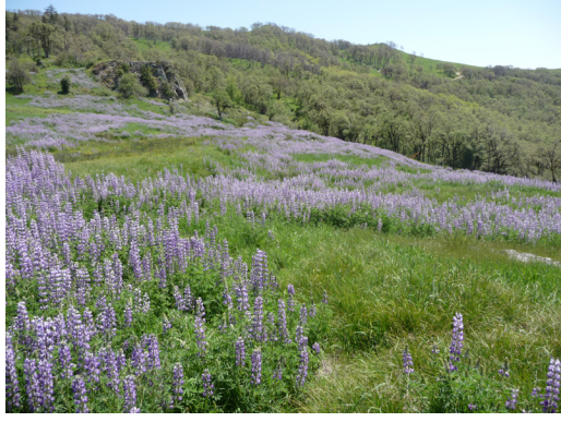
Native lupine tends to have showy displays of flowers two years after prescribed fire.