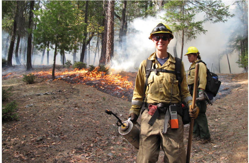
Private ranch in Trinity County during Fall 2013 TREX. The owner uses prescribed fire to reduce fuels and promote healthy, open stands of pine and oak.

Don't forget the experts. There are many specialists who are eager to help you find solutions to make your forest more resilient and fire safe. These include your local Fire Safe Council, CAL FIRE unit forester, RPF, UC Cooperative Extension advisor, RCD specialists, and the Prescribed Fire Council.