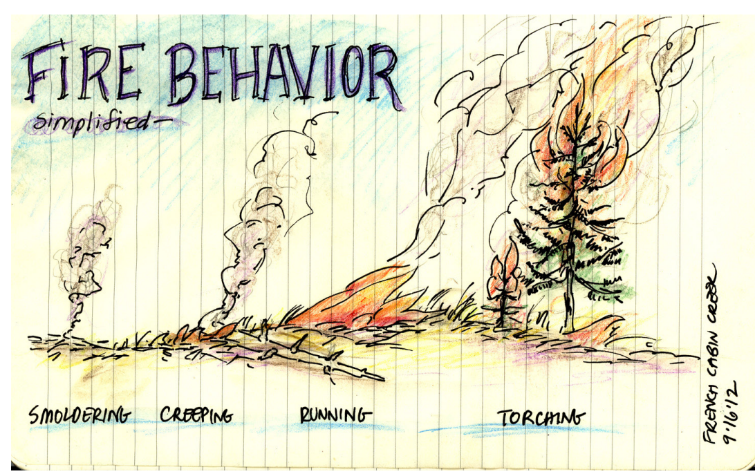
Illustration courtesy Debra Davis

Changes in the moisture content of dead and downed wood is used to predict fire behavior (continued next page)